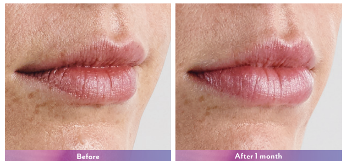
Actual patient. Results may vary. Unretouched photos taken before treatment and 1 month after treatment with 1.2 mL of JUVÉDERM® Ultra XC in the lips.