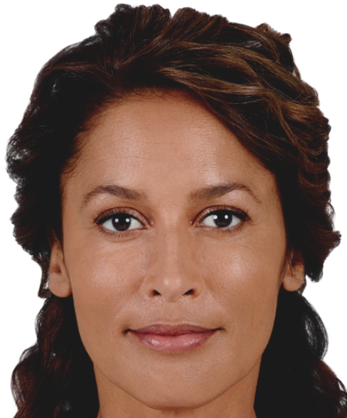
After 1 month

Actual patient. Results may vary. The safety and efficacy of these products for combined use have not been studied. Unretouched photos taken before treatment and 1 month after treatment with JUVÉDERM VOLUMA® XC, JUVÉDERM® Ultra Plus XC, and JUVÉDERM® Ultra XC. A total of 2.6 mL of JUVÉDERM VOLUMA® XC was injected into the cheek area. A total of 3.05 mL of JUVÉDERM® Ultra Plus XC was injected into the parentheses lines, marionette lines, and corner lines. A total amount of 0.7 mL of JUVÉDERM® Ultra XC was injected into the lips.