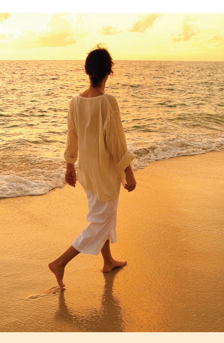
Sun Care Skin Care